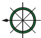
1 ARCHITECTURAL SITE PLAN SCALE 1/32"